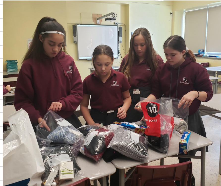
Grade 7 students pack winter care packages for the homeless with items collected in their clothing drive.