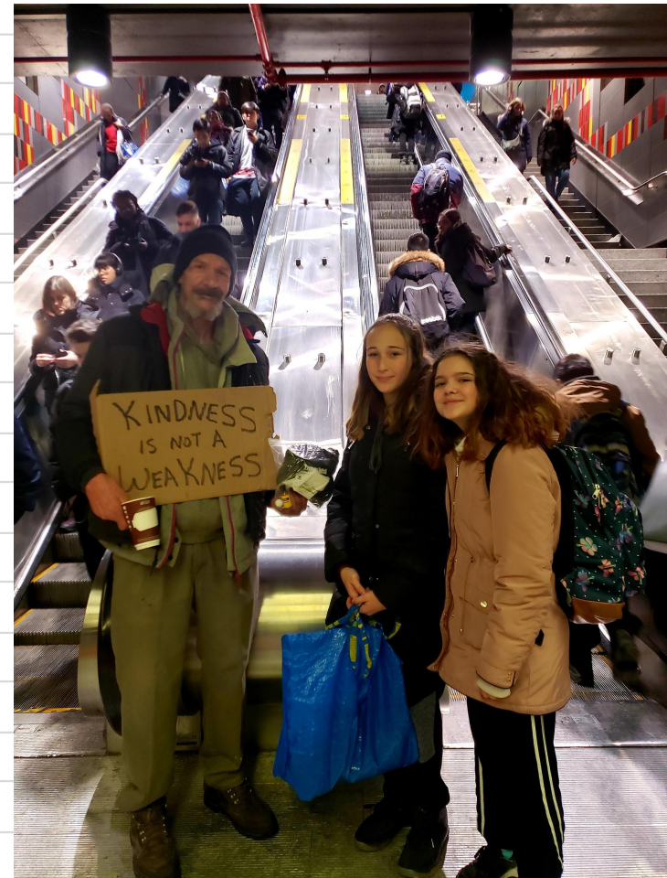
Students personally distribute care packages to the homeless.

The project should aim to serve a real world purpose and genuine needs of the community.